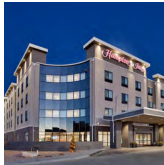
HAMPTON INN 308.234.3400