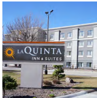
LAQUINTA INN 308.237.4400