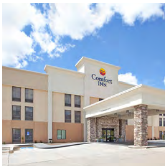
COMFORT INN 308.236.3400