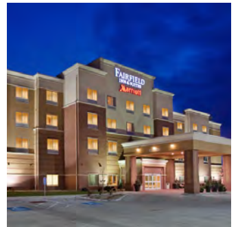
FAIRFIELD INN 308.236.4200