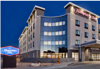
Hampton Inn 308.234.3400