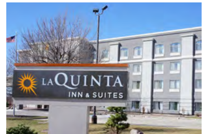
LaQuinta Inn & Suites 308.237.4400