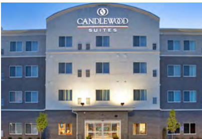
Candlewood Suites 308.234.1100