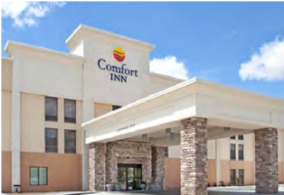
Comfort Inn 308.236.3400