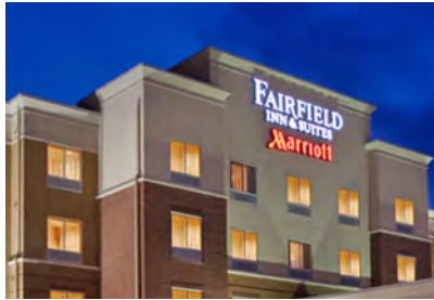
Fairfield Inn & Suites 308.236.4200